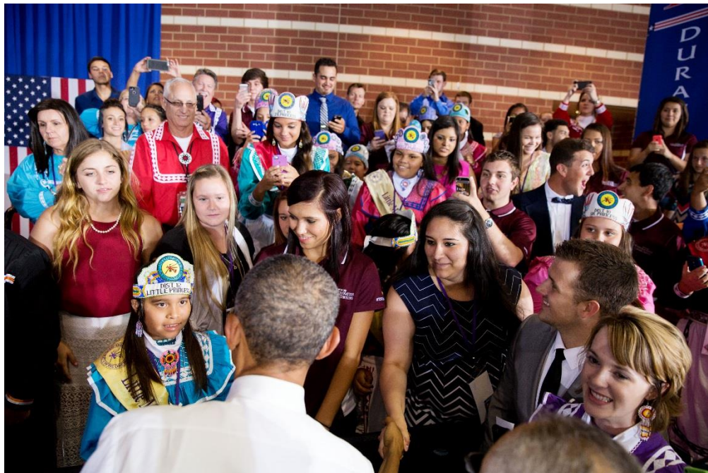
President Barack Obama greets audience members after he delivers remarks on expanding economic opportunity for communities across the country, including the Choctaw Nation of Oklahoma, at Durant High School in Durant, Oklahoma, July 15, 2015.

The Generation Indigenous initiative has provided Native youth with a national platform connecting them to policymakers, elected leaders, educational resources and, perhaps most importantly, each other. The Gen-I movement recognizes the power and knowledge of Native youth to effect positive change, not only within their own communities, but for the nation at large, and encourages youth to share their ideas and experiences with one another. While these young leaders will most assuredly find support in one another, they will also need powerful and compassionate allies to help them on their leadership journey. As it continues to gain momentum, Gen-I will have a perennial advocate through the multi-agency efforts of the White House Council on Native American Affairs. Federal, tribal, and private stakeholders promoting resilient tribal nations must continue to work together. With partnership and support, the youth of Gen-I will continue surging forward, creating strong and thriving tribal communities in their wake.