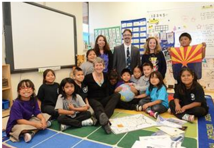
Secretary of Interior Sally Jewell with Native Youth from Salt River Elementary School

Technology plays a critical role in education today. To ensure BIE students have access to the latest technology, DOI partnered with Verizon and Microsoft to provide high-speed cellular data service and hardware to students living in BIE-funded dormitories. Portable tablets will allow these students to enhance their learning in and out of the classroom.