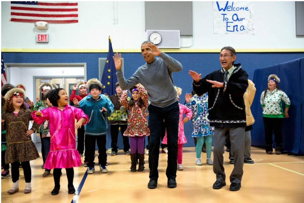
President Barack Obama joins students for a Yup'ik cultural dance performance at Dillingham Middle School in Dillingham, Alaska, Sept. 2, 2015.