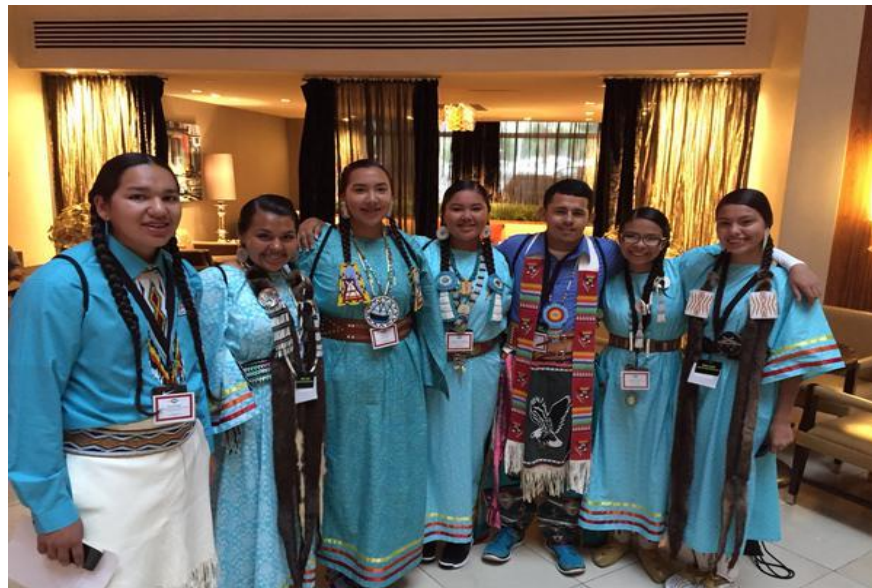
Native Youth from the Warm Springs Nation at the White House Tribal Youth Gathering, July 9, 2015

In July 2015, the White House released FY 2017 budget guidance directing agencies to prioritize Native youth programming and coordinate around six different outcome goals. The six different outcome goals are to: improve educational outcomes and life outcomes for Native youth; increase access to quality teacher housing; improve access to the Internet; support the implementation of the Indian Child Welfare Act (ICWA); reduce teen suicide; and increase tribal control of criminal justice. The ultimate objective is to improve educational and life outcomes for Native youth through increased cross-agency budget coordination and support for effective programs, self-governance, and measurement of success.